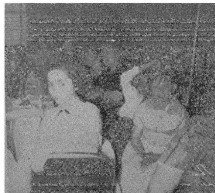
1958 Third Seder Presidium in New York