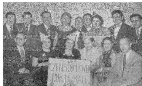
The committee of the Purim Ball, which was held on 28 th February 1953