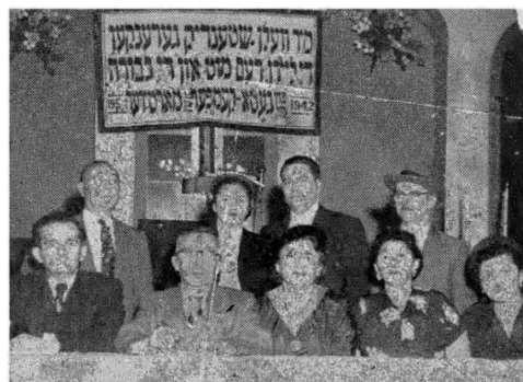
The Executive at the 1954 Memorial Service